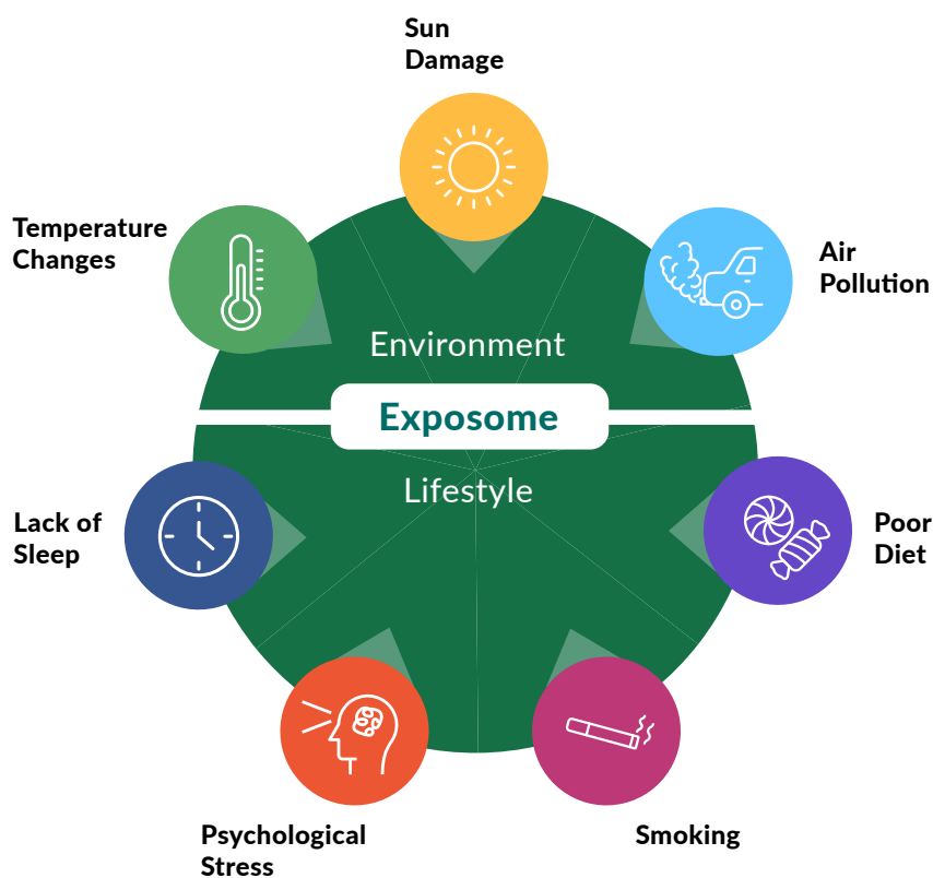
Figure 1. Exposome: Behavioral, Environmental, and Social Factors That Influence Aging