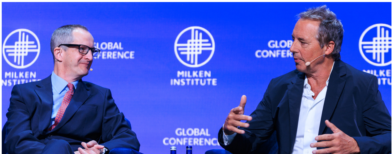
James Bethell (left) and Dan Buettner spoke on "Longevity Lab: Can You Live to 100?" at the Milken Institute 2024 Global Conference in Los Angeles.

choice the easy choice." Enriched environments offer valuable insights into designing urban spaces to improve brain health. 25 These environments support individuals' physical, mental, social, and cognitive needs, promoting neurogenesis and enhancing brain health. Cities embracing characteristics of environmental enrichment can foster brain health and longevity through initiatives such as providing affordable housing with ample light and social spaces, colocating living and learning areas, prioritizing multimodal mobility, and facilitating access to nature and healthy food options.